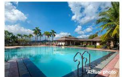
20m Lap Pool