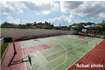
Multi-Purpose Court w/ Bleachers