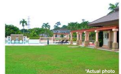
Garden with Gazebo