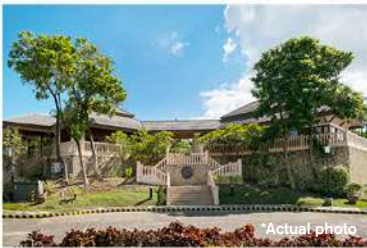
Social Hall & Clubhouse