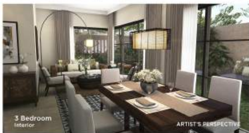
3 Bedroom Interior